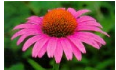
Purple Cone Flower

of the endangered plant species in the park; the Purple Cone Flower and Pyne's Ground Plum. Visitors should remain on the trail to avoid damaging these fragile natural resources.